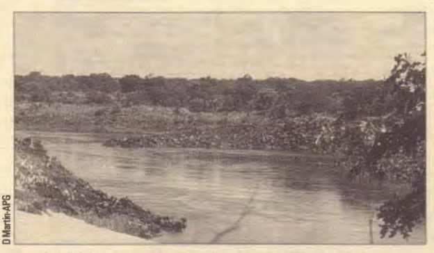
Zambezi river in western Zambia: shared by eight SADC countries

Water experts have warned that freshwater will be a strong weapon as populations increase in the face of scarce water resources.