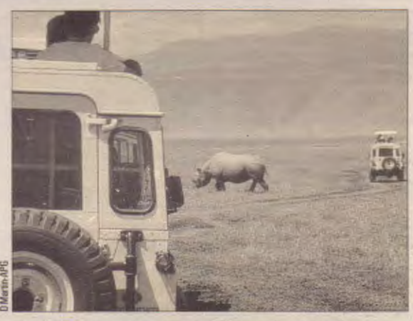
WILDLIFE: one of the region's major tourist attractions

"However, southern Africa is still a very small player with only one percent