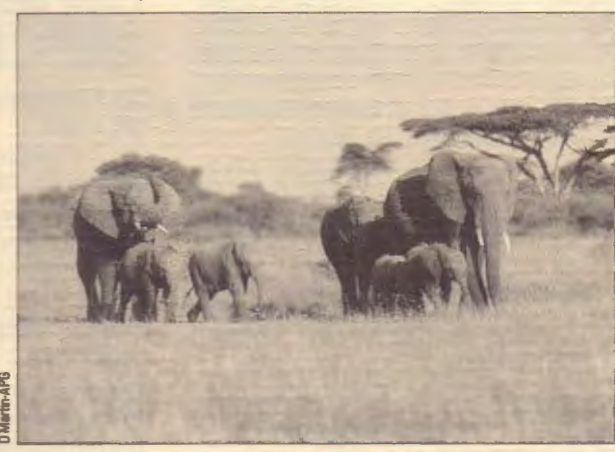
Elephants at Ndutu near Serengeti National Park, Tanzania

going back home excited, practical conservation news," pointing out that it is the only possible way that "our people can benefit from welfare and our conservation."